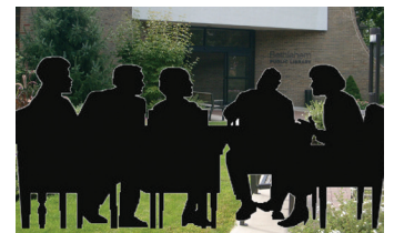
Trustee candidate info Page 8