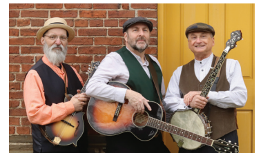
Lost Radio Rounders Page 4