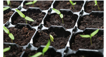
Seed Library Page 2